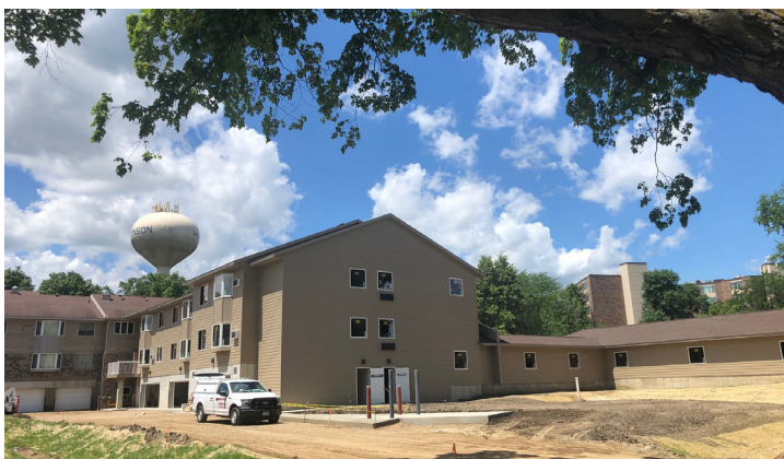
New addition at Prince of Peace Retirement Living.

To find out more information about any of these programs, contact Common Cup at 320-587-2213 or visit www.common-cup.org .